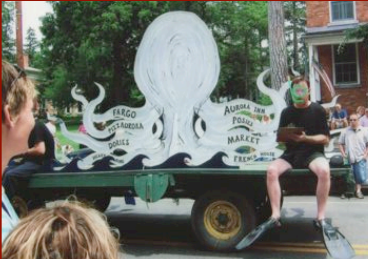
2005, "It's in the Water:" "Octopied"

Tudy's floats on current Village topics became legendary.