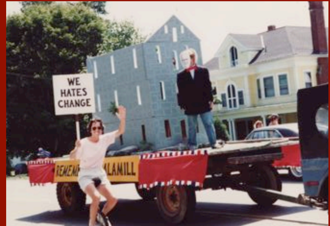
1993, "Changing Times:" "We Hates Change (Old Mill)" Tied for 3rd Place